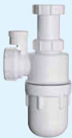
C10AV - Bottle trap