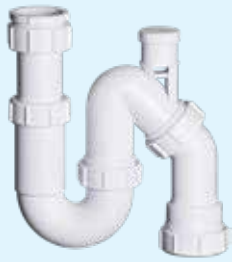
SP40AV - 40mm trap