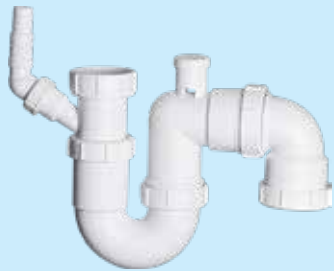
SP50AV - 50mm trap