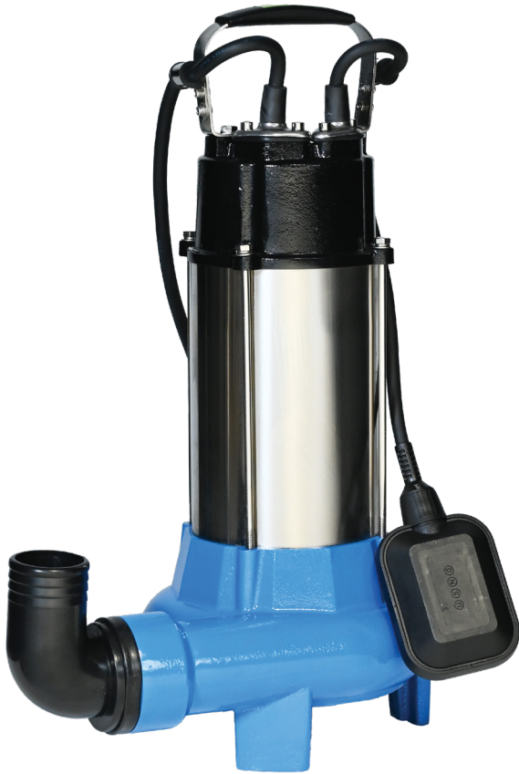
7575170 Waterboy™ 270L Cutter Pump